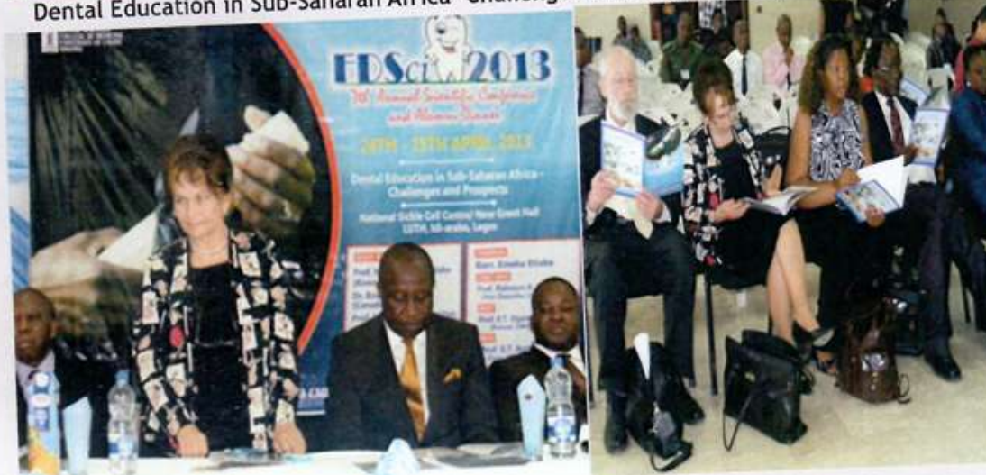
PHOTO REAL OF OUR HUMBLE BEGINNINGS IN LAGOS, NIGERIA. - FROM 2014 TO 2019 Dental Education in Sub-Saharan Africa -Challenges and Prospects-24th-25th April, 2013