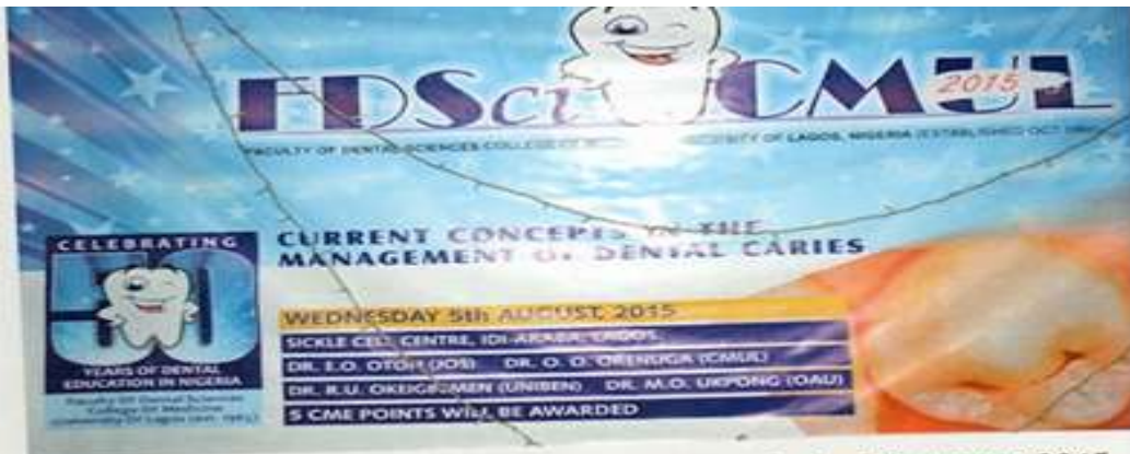
Current Concepts in the management of Dental Caries 5th August 2015. Idi-Araba, Lagos, Nigeria.